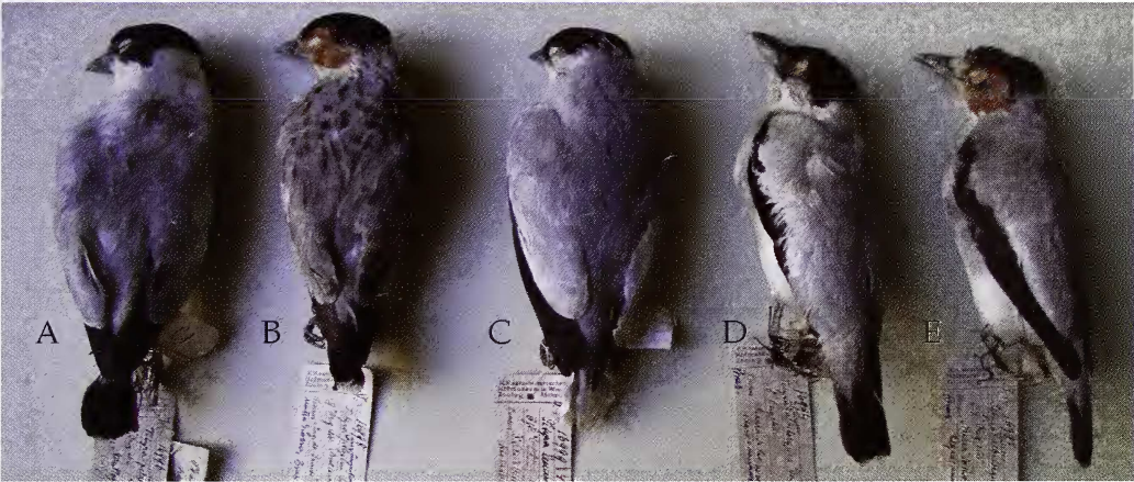
Figure 5. Dorsal view of males and females of Black-crowned Tityra T. inquisitor pelzelni (A and B) and T. i. albitorques (D and E), compared to the male holotype of White-tailed Tityra T. leucura (C) (E. Bauernfeind)